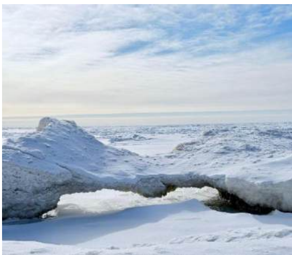
Sunny January Beach Days on Lake Erie.