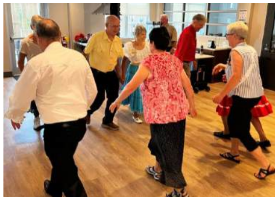
Talbot Manor Retirement Home, St Thomas

We wish everyone a Merry Christmas! Happy New Year too!