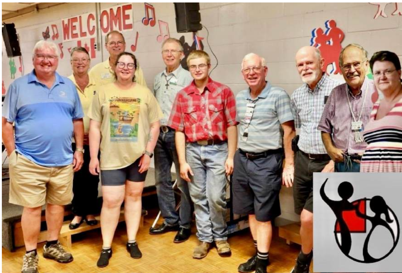
Staff