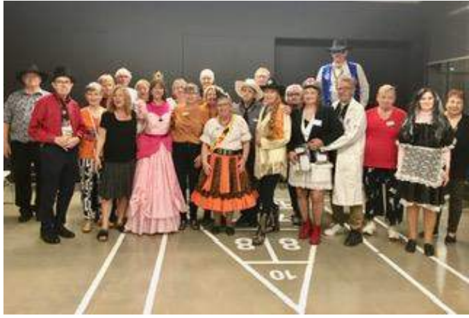
Our Group of Halloween Dancers!

We are looking forward to having our 'NATIONALITY DANCE' where we will dress in the costumes or outfits that match our family heritage. This will be held on Friday November 17th. Come on out if you like. Our goodies that night will also reflect foods from the country that our parents, grandparents or great grandparents came from. This will be a 'new' Special Dance for us and we hope to get lots of good input.